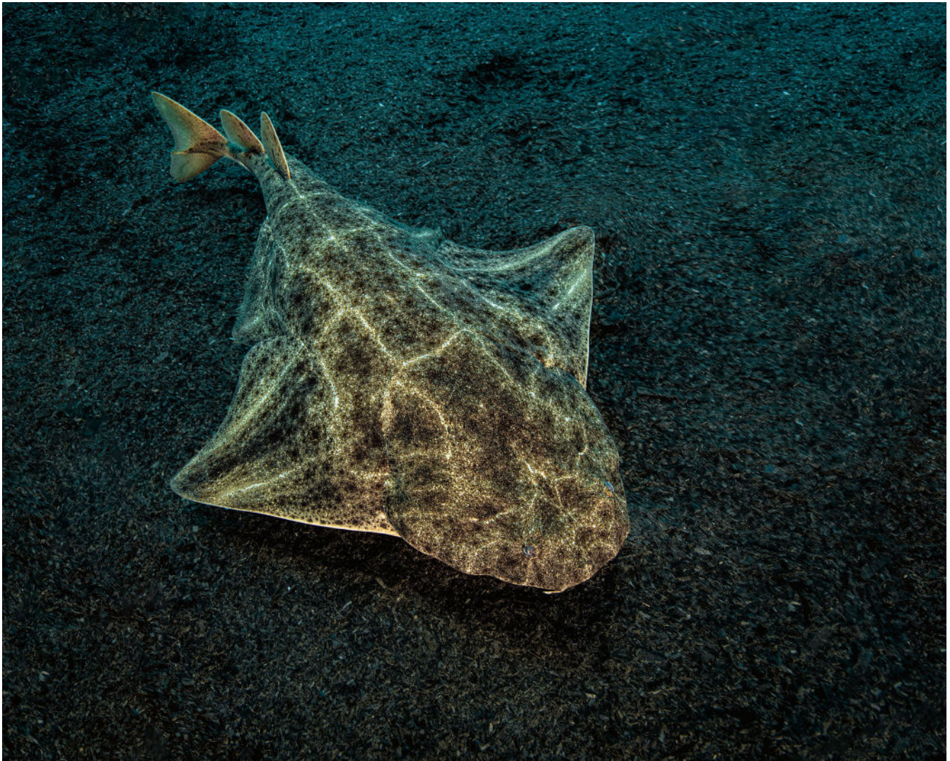
FIGURE 1 The angelshark ( Squatina squatina ). This individual was observed by the diver Laurent Ballesta at a depth of 40 m on the eastern coast of Corsica near Biguglia, south Bastia, in June 2020.

Resource Coordinators, 2016) was conducted for S. squatina and its two sympatric species ( S. aculeata and S. oculata ). Cytochrome c oxidase subunit I (COI) and 16S sequences were available for all three Squatina species, and 12S sequences (from three complete mitochondrial genomes) were available for S. squatina only. These sequences were extracted from NCBI and aligned using Geneious Prime 2021.0.3 to identify a primer pair and a probe to target a barcode for S. aculeata , S. oculata , and S. squatina . The probe and primers were designed using this software following the criteria set out in the protocol of Klymus et al. (2020) (see Appendix S3). This resulted in the following forward and reverse primer pair and probe targeting a 173-bp (with primers excluded) barcode of the COI region within the mitogenome of S. aculeata , S. oculata , and S. squatina :